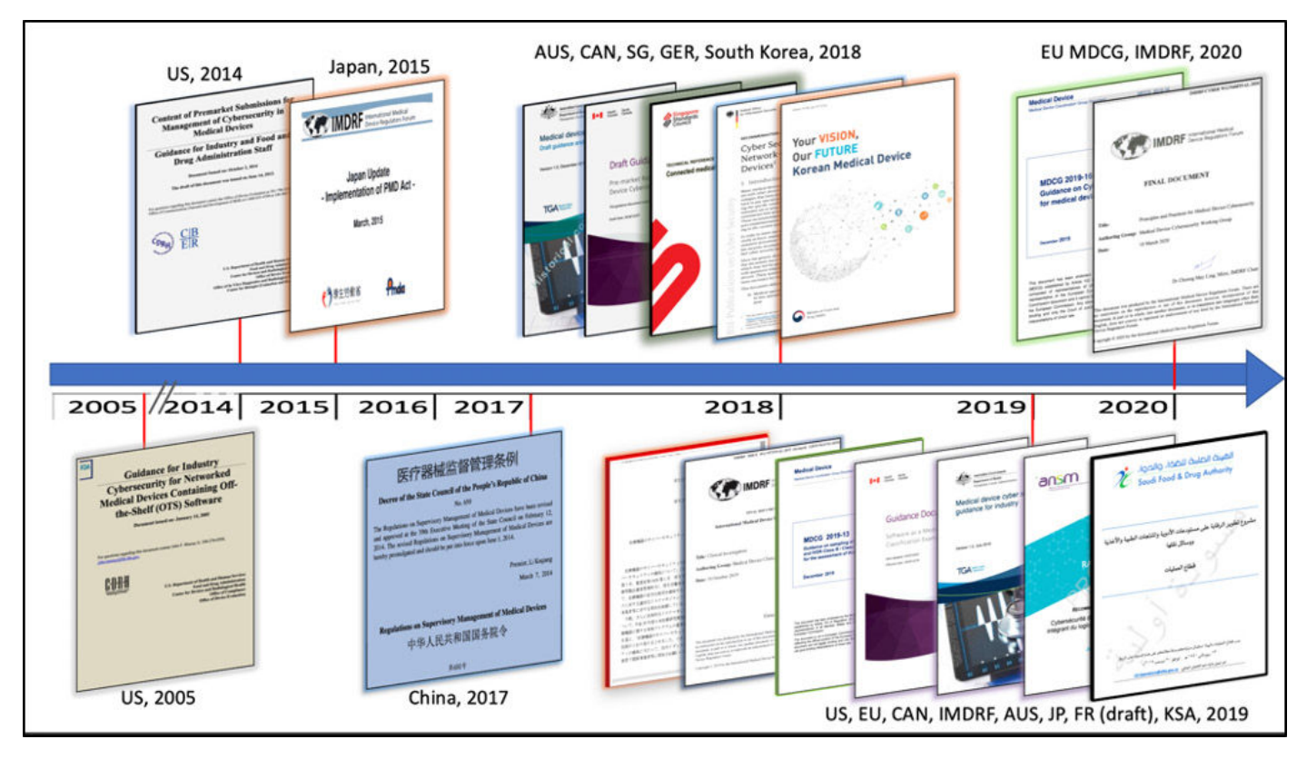
Figure (1) showing timeline of documents release year and publishing agencies

Cybersecurity is a global issue that has driven the development of specific regulatory guidance documents in many countries. As more connected medical devices are added to hospital networks, regulators have increased their oversight and scrutiny when reviewing products requesting market approval as well as when monitoring medical devices during the postmarket phase. Starting in 2005 and rapidly increasing in 2018-2019, the global medical device market has seen the launch of new guidance from countries such as the United States, Canada, Australia, and the European Union (Fig.1). This proves challenging to manufacturers trying to balance these expectations. This document is intended to provide some clarity to that landscape.